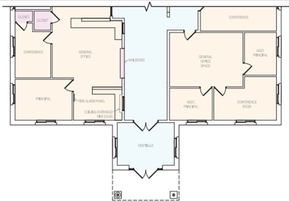
Existing First Floor Plan Scale: 3/16" = 1'